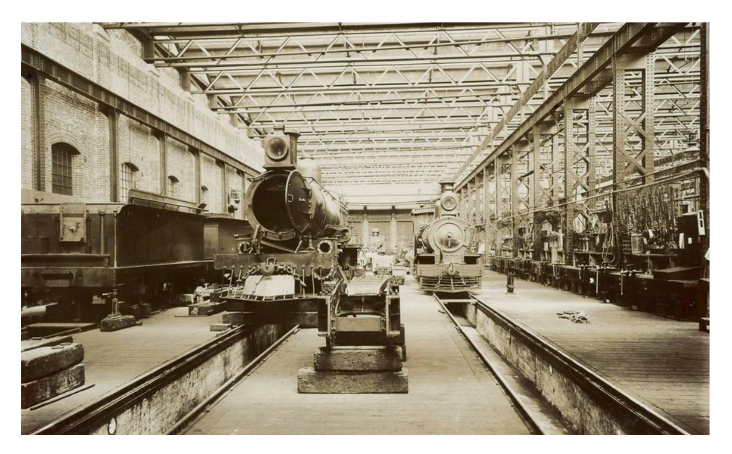
Midland rail workshop