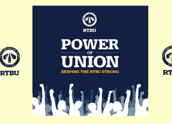
Delegates - Keeping the RTBU Strong!

Rail Tram and Bus Union Unit 2/10 Nash Street, Perth WA 6000 www.rtbuwa.asn.au general@rtbuwa.asn.au (08) 9225 6722