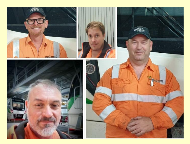
EDI Bargaining Reps - Union & Proud!

A Transit Officer JCC is to occur on the 28<sup>th</sup> of October 2020. At this meeting, attendees will look to discuss several topics including the 'Suffocation and strangulation' charge, the retention survey, and video & audio on top of delta vehicles and in the pods.