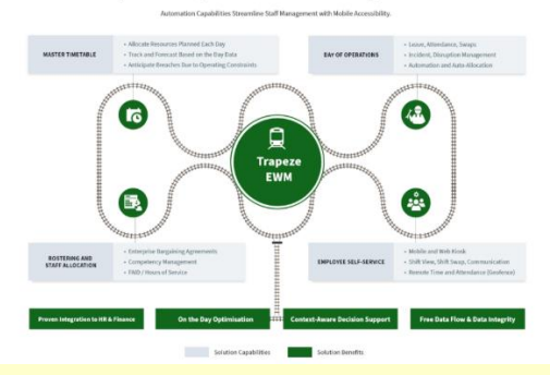
The Trapeze Enterprise Workforce Management Solution

"I can see how the system, which will first be rolled out to TTO Drivers early 2021, will become a 'gamechanger' in the fair and equitable building of operational rosters"