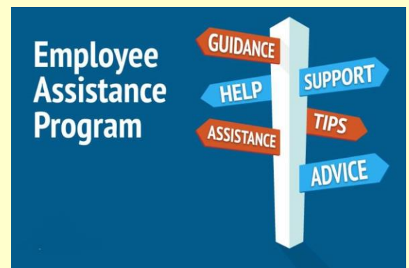
If you do not know how or who to contact reach out and the RTBU will assist

Rail Tram and Bus Union Unit 2/10 Nash Street, Perth WA 6000 www.rtbuwa.asn.au general@rtbuwa.asn.au (08) 9225 6722