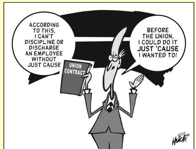
Know your rights and seek assistance

http://www.allriskprotection.com.au/ or www.rtbuwa.asn.au